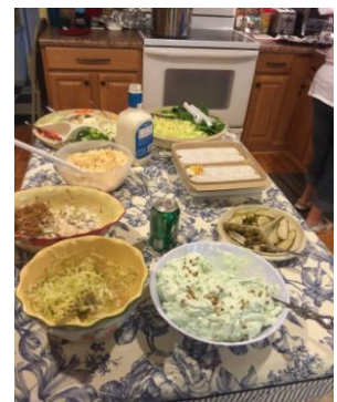
Some of the fabulous food at our party